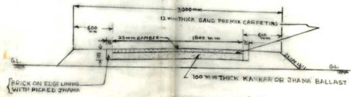
ROAD TYPE C SCALE - 1 CM = 20 CM