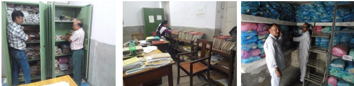
Cleaning of Almirahs & Record cleaning at CMS office, Matron record room