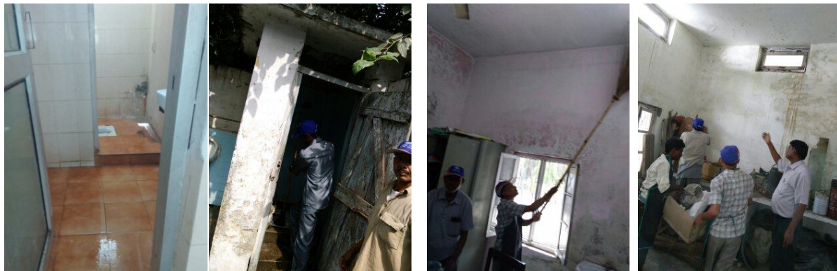
Cleaning of Toilet at CMS office, Removal of Jala, CHI office