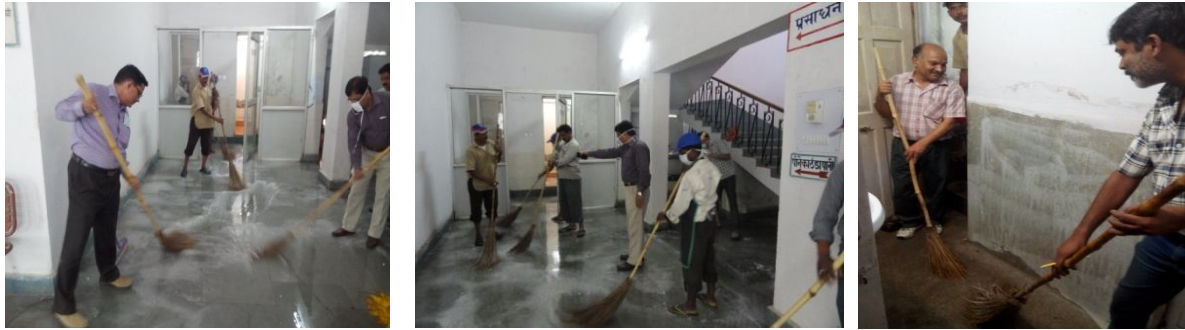
Shramdaan by CMS, ACMS and Railway staff